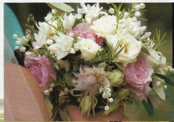
Florist Mathew Dickinson created a bouquet of Leila's favourite flowers – tuberoses, roses and tiny proteas