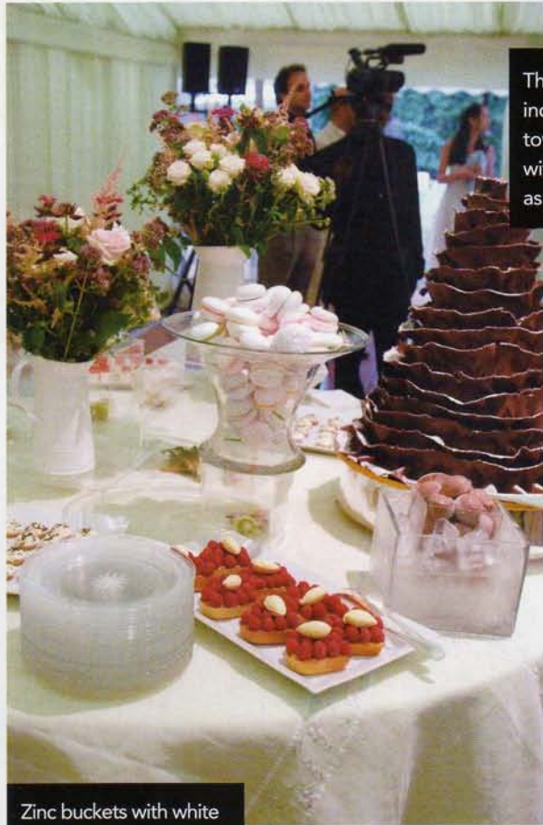
The dessert buffet included a delicious tower of profiteroles with chocolate frills as the wedding cake