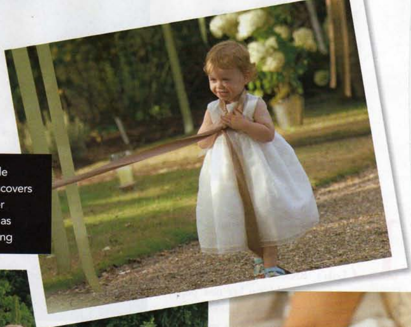
One of the little flower girls discovers the sash on her dress doubles as a great plaything

“Our florist created amazing beautiful centrepieces to scattered oles and potted hydrangeas in the Leila. “He also hung white, pink apanese lanterns and wide, long the trees – which fluttered ▶